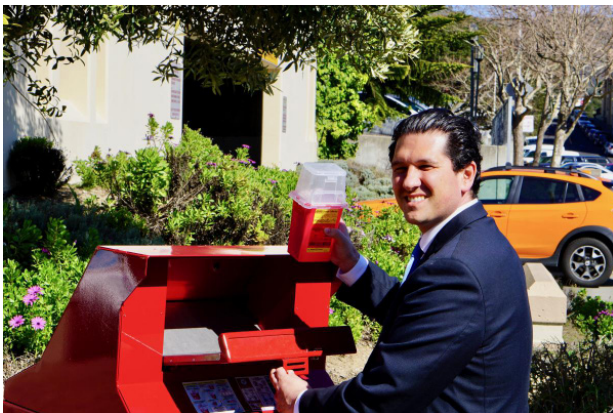
Figure 4. Bio-hazard drop-off collection bin