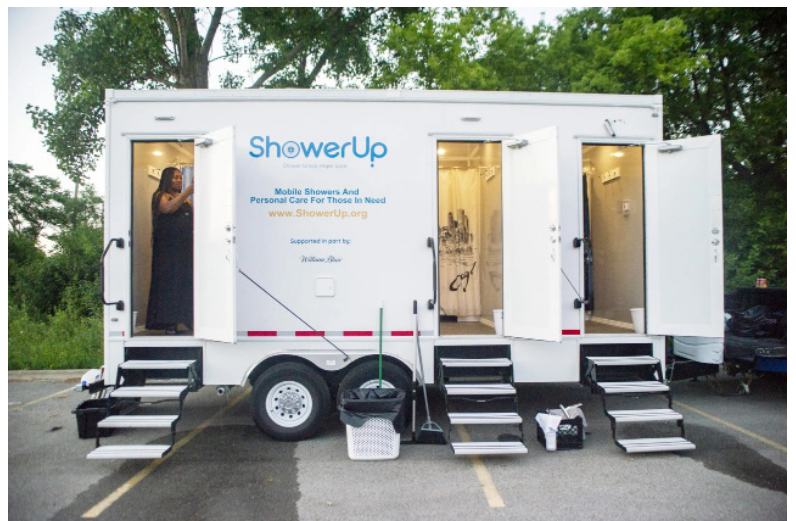
Figure 2. Mobile showering unit