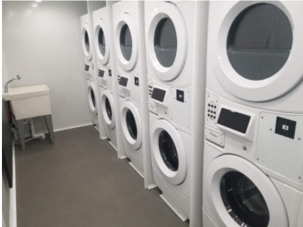
Figure 3. Mobile laundromat unit